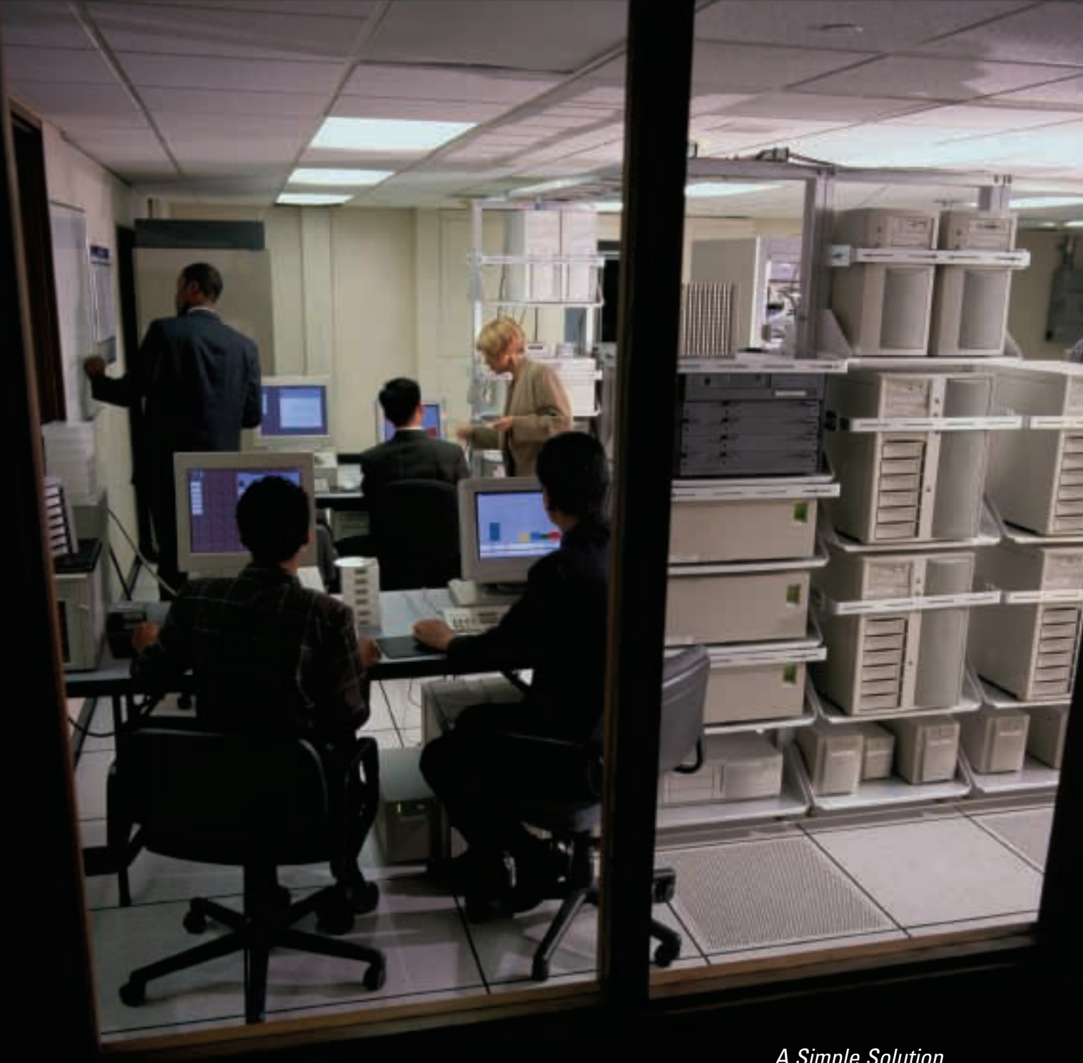
A Simple Solution An Affordable Approach An Industry Innovation